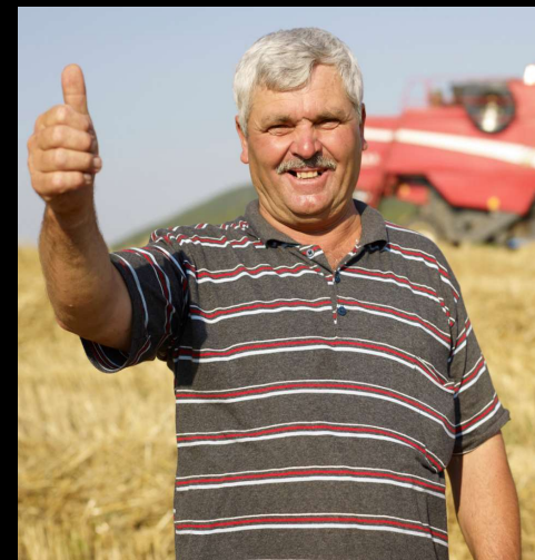
LARGE SCALE FARMER